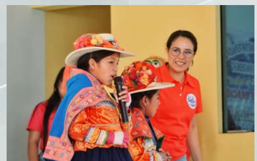
Traditional mountain dress!