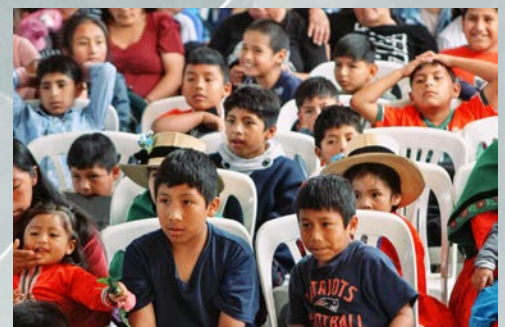
A crowded house!